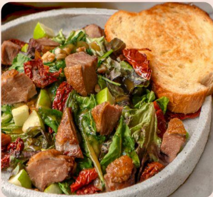
Smoked Duck & Apple Salad 250 With dried tomatoes, green leaves and sourdough toast