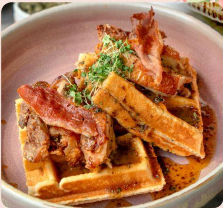
Buttermilk Fried Chicken & Savory Waffle 220 A unique mix of savory and sweet, a flavorful combination