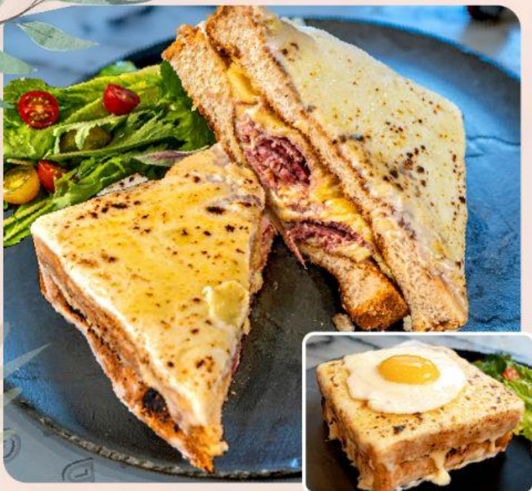
Croque Monsieur 260 French ham & cheese sandwich, Bechamel, Gruyere, Parmesan Extra fried egg on top +30