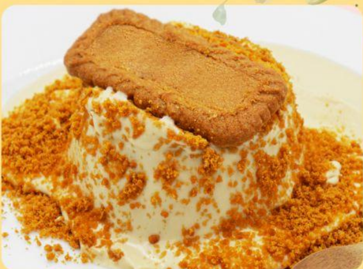
Biscuit Molten Cake 165 Biscoff sponge cake with Biscoff cream flavor & Biscoff crumble