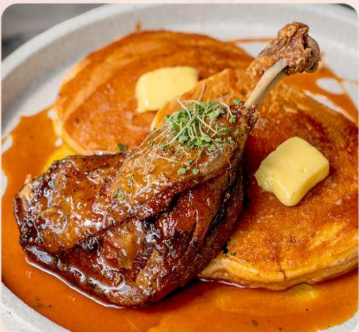
Duck Confit Pancakes 220 Duck confit with an orange glaze on top of 2 buttery pancakes