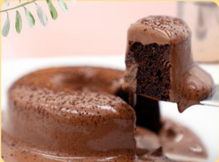
Belgian Chocolate Molten Cake 165 Chocolate buttermilk soft cake with 70% Belgian chocolate cream